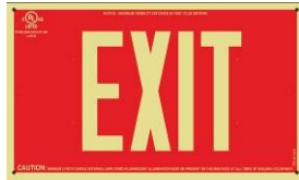
Without the use of the directional chevrons

The sign is supplied with two self-adhesive photoluminescent directional chevrons that can be used to show the direction of travel to the exit as necessary in the possible options shown below: