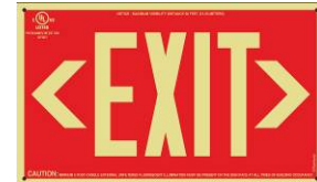
Using directional chevrons to both left and right

Note: The adhesive backing used in the directional chevrons is a product that complies with the Standard for Marking and Labeling Systems - UL 969.