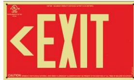
Using a directional chevron to the left