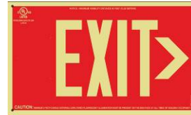
Using a directional chevron to the right