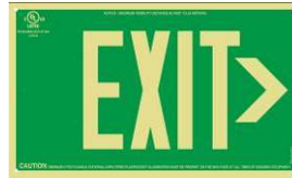
Using a directional chevron to the right