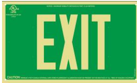
Without the use of the directional chevrons

The sign is supplied with two self-adhesive photoluminescent directional chevrons that can be used to show the direction of travel to the exit as necessary in the possible options shown below: