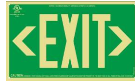
Using directional chevrons to both left and right

Note: The adhesive backing used in the directional chevrons is a product that complies with the Standard for Marking and Labeling Systems - UL 969.