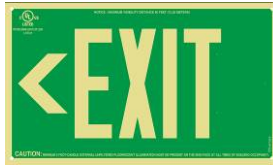
Using a directional chevron to the left