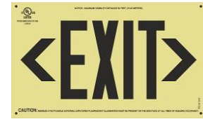
Using directional chevrons to both left and right

Note: The adhesive backing used in the directional chevrons is a product that complies with the Standard for Marking and Labeling Systems - UL 969.