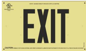
Without the use of the directional chevrons

The sign is supplied with two self-adhesive black color directional chevrons that can be used to show the direction of travel to the exit as necessary in the possible options shown below: