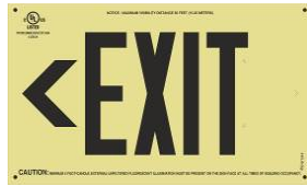
Using a directional chevron to the left