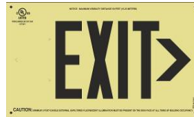
Using a directional chevron to the right